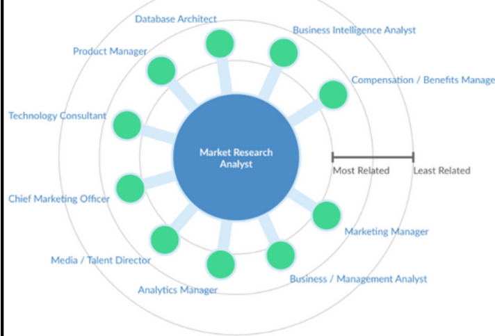
Related Jobs - Career Pathways Report